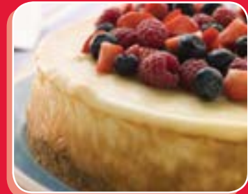
Classic Cheesecake $3.25