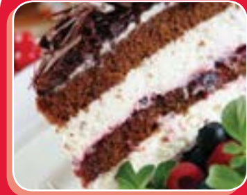
Assorted Layer Cake Chocolate, White & Red Velvet $3.25