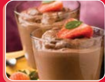
Chocolate Mousse $3.25